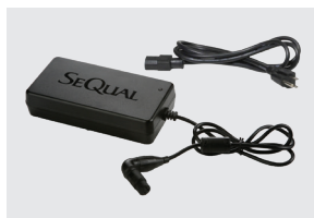
AC POWER SUPPLY