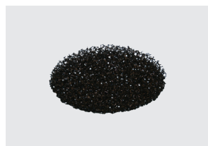
SPARE INTAKE FILTER