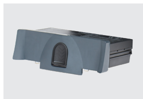
POWER CARTRIDGE (BATTERY)