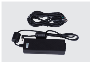
AC POWER SUPPLY (CORDS AVAILABLE SEPARATELY)