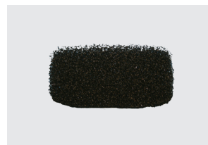
SPARE INTAKE FILTER