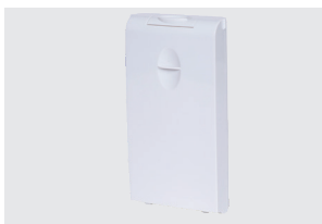
EXTRA BATTERY PACK