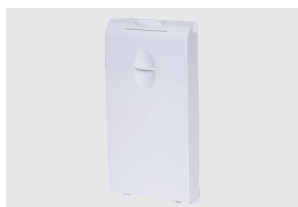
EXTRA BATTERY PACK