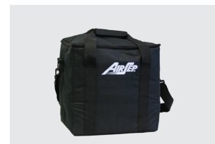
CARRY-ALL ACCESSORY BAG