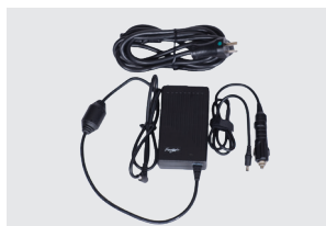
AC/DC POWER SUPPLY (CORDS AVAILABLE SEPARATELY)