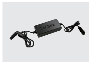
DC POWER SUPPLY