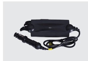
DC POWER SUPPLY