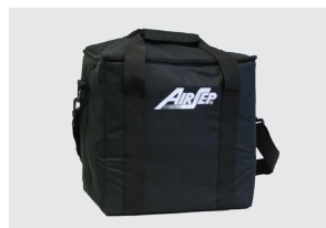
CARRY-ALL ACCESSORY BAG