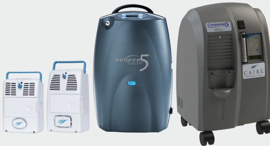
Wearable, Portable, and At-Home Technology